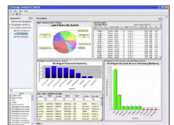
Dashboards Highlight Compliance Posture

SenSage Compliance Auditing for SOX provides the industry's only event data warehousing solution aimed specifically at overcoming the technical challenges facing today's IT organizations. By integrating the collection, storage and analysis functions, as well as designing the solution specifically for event data, SenSage is able to provide a simple yet accurate method for monitoring, analyzing and ultimately complying with SOX requirements.